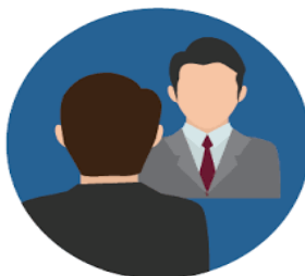
The specialist in the field of mediation and conflict regulation

Conflicting procedural communicative reflexive